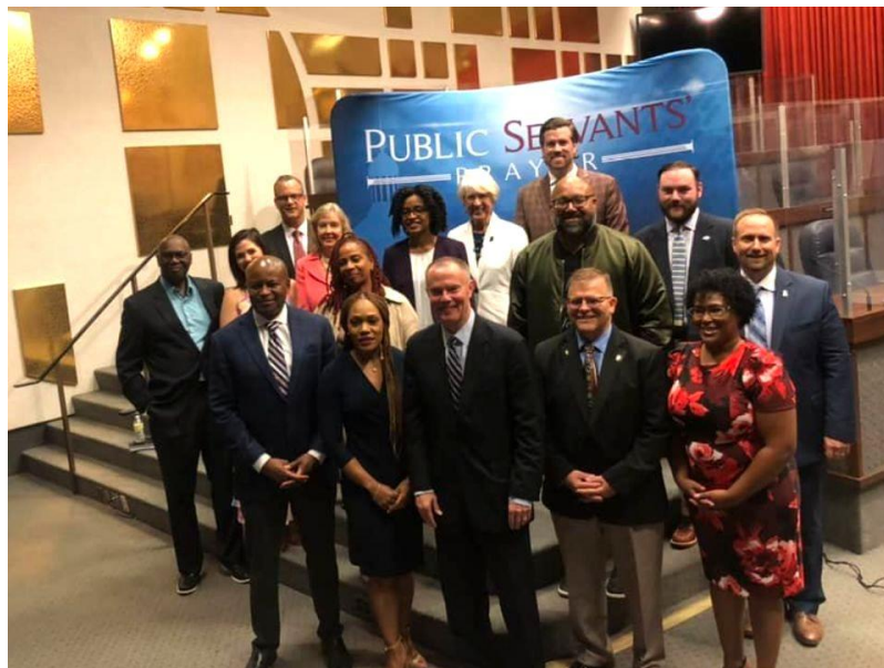
Indianapolis Prayer Service 2022

Our 3rd Annual Indianapolis Prayer Service was a great success and broadcasted live across the city’s television channel where it is forever archived! The Prayer Caucus has also been a sweet time of lifting up our Councillors and their prayer requests. We continue to see growth in our impact and influence on all floors of city government.