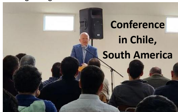
Conference in Chile, South America

In May we enjoyed getting together with our children and grandchildren. It was the first reunion in four years! We are so grateful that our children are all living for the Lord and are raising our grandchildren to love Jesus!