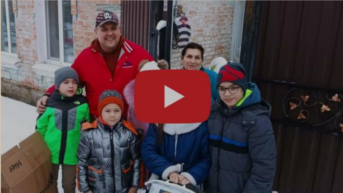
Christmas in Eastern Europe