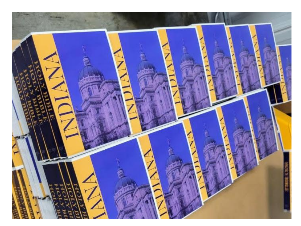
Indiana Statehouse Edition Bibles from Seedline International

customized Bibles from Seedline International! These Bibles, with their exclusively designed Indiana Statehouse covers, were eagerly sought after from the book table. What an incredible impact! Please pray for those who received these materials to be saved and/or to grow in their relationship with Christ.