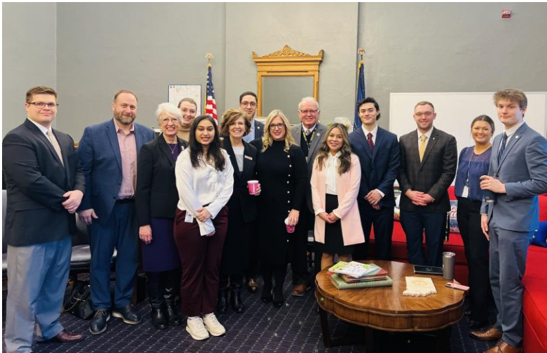
Faith@Work Launch 2025