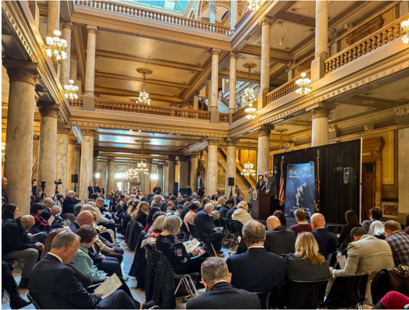
Governor Eric Holcomb Praying at the Statehouse Prayer Service